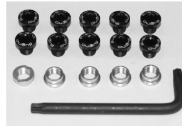
"Compact Plus+" Bolt Nut set Model No. #803