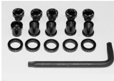
"OX801D-PCD110mm" Bolt / Nut / Spacer set Model No.#801