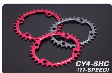
Non-circular Super Hill Climb Chainring