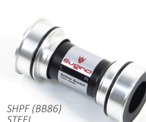
SHPF (BB86) STEEL