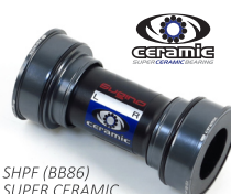
SHPF (BB86) SUPER CERAMIC